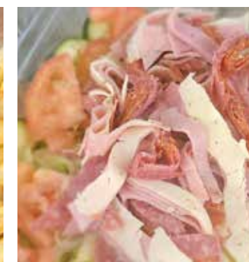
#15 ITALIAN SPECIAL SALAD