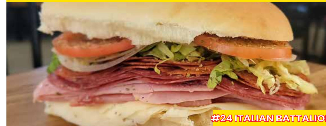
#24 ITALIAN BATTALIO